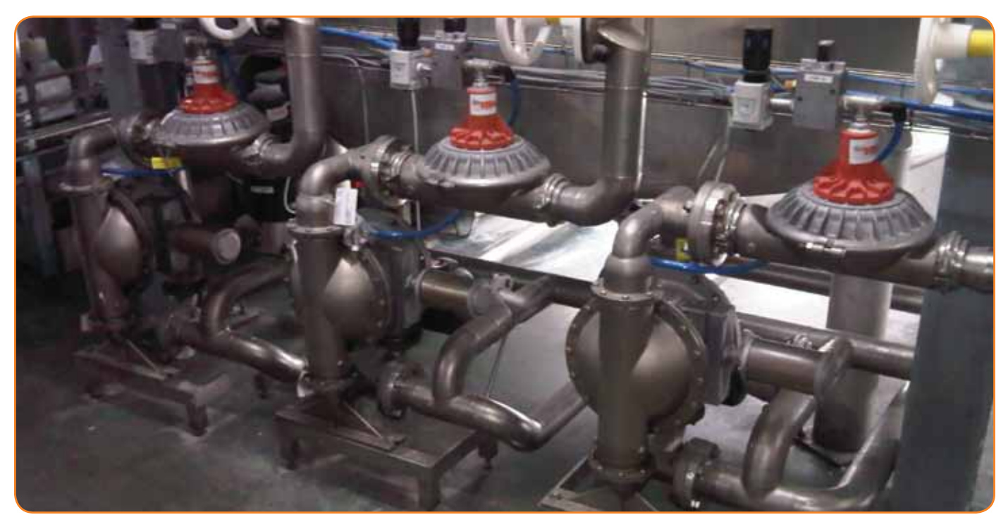
AODD pumps feature strong suction and can provide a "dry prime" by drawing fluid from tanks no matter the location.

Wilden's Advanced<sup>™</sup> Series Metal and Plastic Bolted AODD Pumps are specifically designed for maximum performance, efficiency and containment. The bolted configuration ensures product containment, while the absence of a mechanical seal or packing reduces the risk of leaks and pump failure. Another containment feature is Wilden's integral piston diaphragm. Most AODD pumps offer multiple-piece diaphragm configurations, but Wilden's integral piston diaphragms are single-piece design, which eliminates any potential leak points.