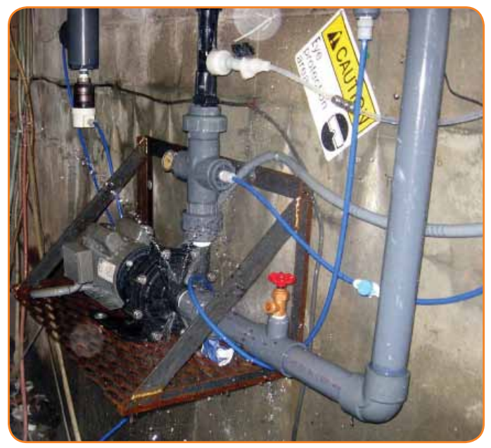
A mag drive pump caused a fluid rupture in a hazardous chemical application, putting workers at great risk.