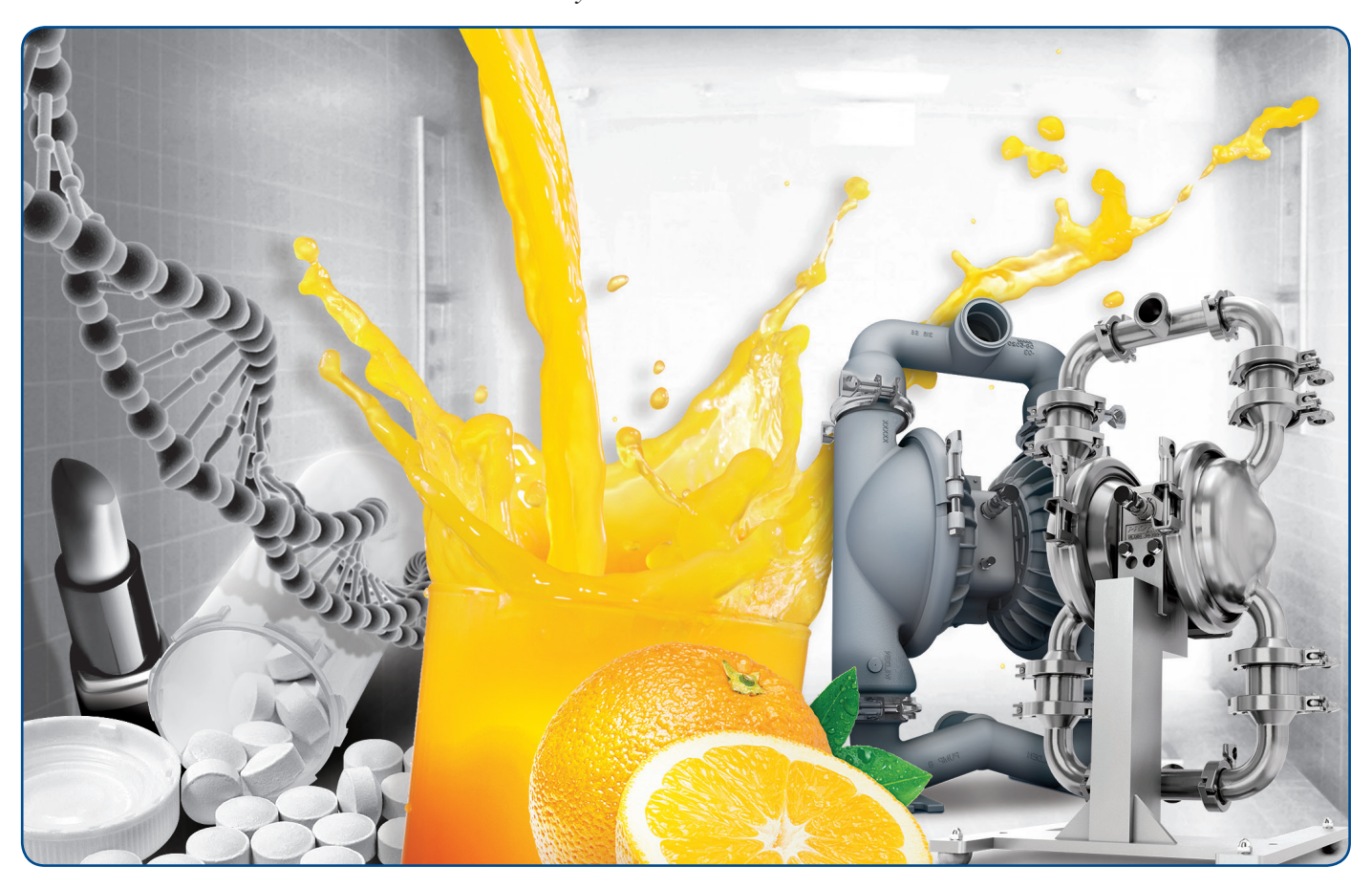
Strict 1935/2204/EC regulations mean that food processors must take extreme care when selecting the equipment used to create their products. This includes the pumping equipment used extensively throughout the food-production process.

Over the years, a number of standards and compliance requirements have been established for the food-processing industry by different regulatory agencies around the world. For any product going onto grocery store shelves and restaurant menus, food processors must satisfy the "alphabet soup" standards handed down from organizations such as the U.S. Food and Drug Administration (FDA); 3-A Sanitary Standards, Inc., (3-A); and the European Hygienic Engineering and Design Group (EHEDG). In addition, food processors must also comply with standards and regulations imposed by individual countries or governmental entities.