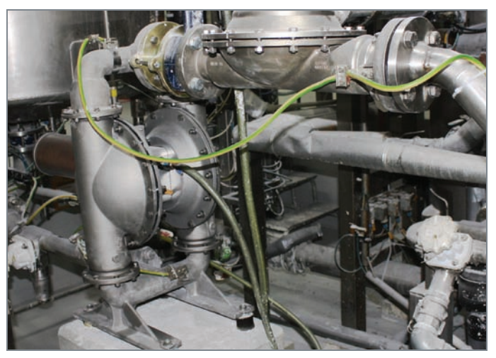
Reliability is a key characteristic of the Wilden<sup>®</sup> Advanced<sup>®</sup> Series AODD Pumps as a single pump is required to pump base polymers to 11 different machines around the clock in Villeroy & Boch's Wellness manufacturing operation.

"For the Pro-Flo SHIFT, Holland Air Pumps showed us what the savings could be in our particular situation," said Nieman. "They made a very good case, showing us the actual pump and showed us that we could make an annual €5.000 ($6,200) a year in savings with quite a small investment. The return on investment is three months and that is a very short return on an investment period for any pump."