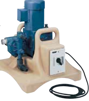
ELECTRONIC STROKE CONTROL

May be used with 500-S, 500-D, 500-A, 500-E, or 560 pumps