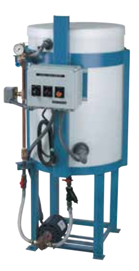
Two Pumps Bottom Mounted

Automatically add glycol solution to make up for leakage in closed loop water systems.