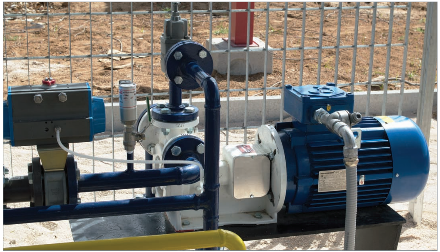
Ebsray® RC40 Series Regenerative Turbine Pumps feature a motor that is smaller than competitive pumps, resulting in energy-cost savings. Despite the smaller motor, the RC40 pump will easily, reliably and economically produce differential pressures up to 14 bar (200 psi) with flow rates up to 200 L/min (52.8 gpm).