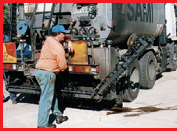
Engineered in Australia