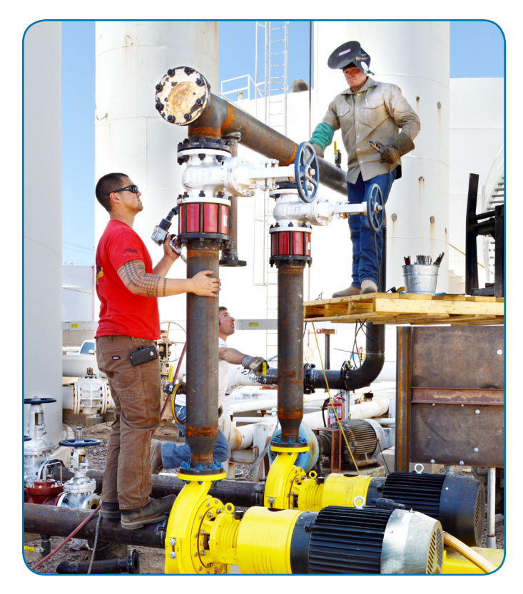
Because of their proven reliability and ease of maintenance, Blackmer pumps are the only brand that Caljet of America, LLC will install.

and operational issues such as seal failures, bearing failures, coupling problems and continual pump/motor misalignments.