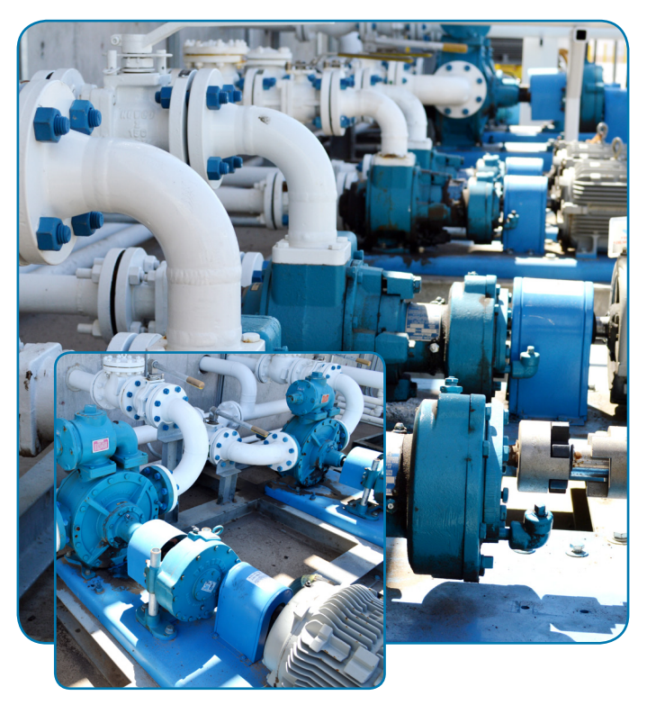
With their ability to produce an extremely accurate flow at lower volumes, Blackmer MLX and GX Sliding Vane Pumps provide low-volume blending of additives, ethanol and biodiesel.

Caljet was introduced to Blackmer System One pumps during its first terminal expansion in 2004.