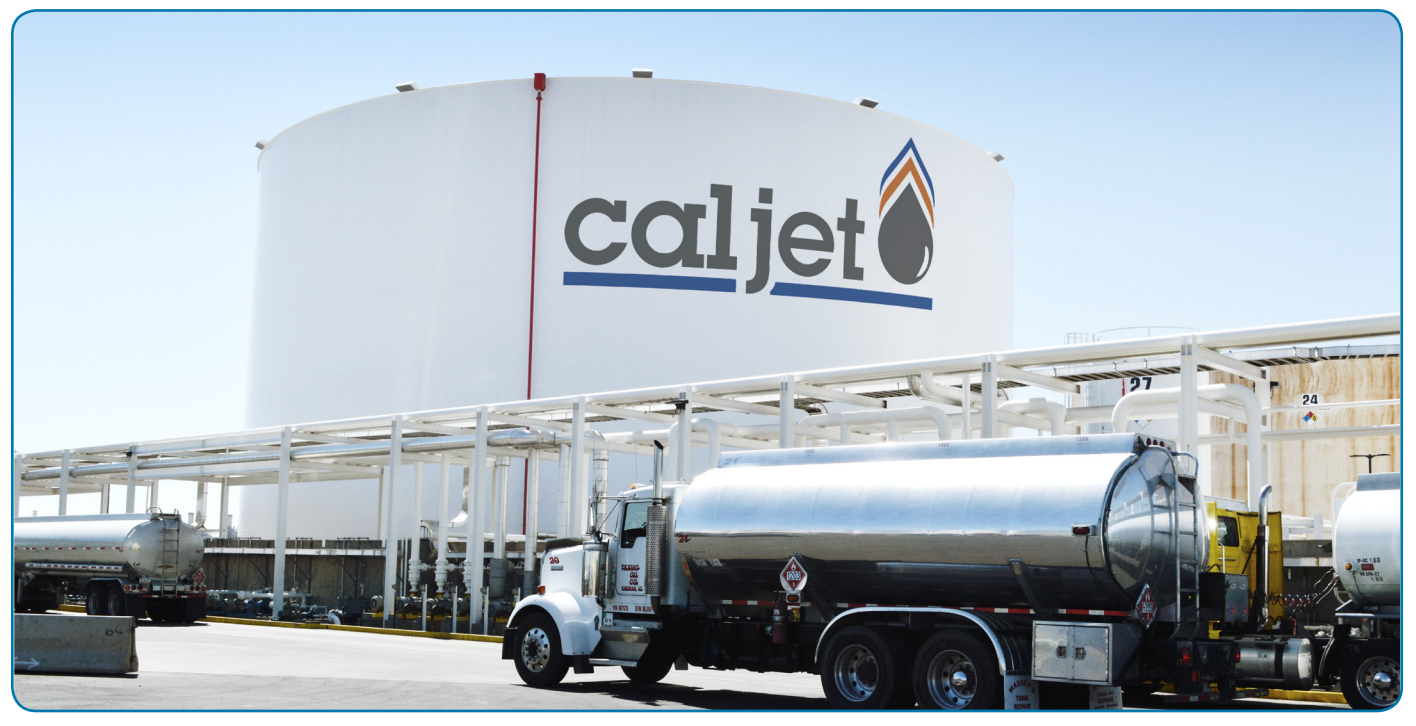
With more than one million barrels of storage capacity, Caljet of America, LLC handles approximately 50% of the refined and renewable motor fuels consumed in this marketplace and is projected to pump more than one billion gallons of fuel and additives in 2014.

Like the blazing desert sun on a scorching summer day, Caljet of America, LLC, is the hottest fuel handling company in Arizona. Based in Phoenix, AZ, USA, Caljet operates five state-of-the art storage-tank farms, unloading facilities, dispensing terminals and customerfocused operations that have been recognized repeatedly, both locally and nationally, for outstanding innovation, commitment and drive.