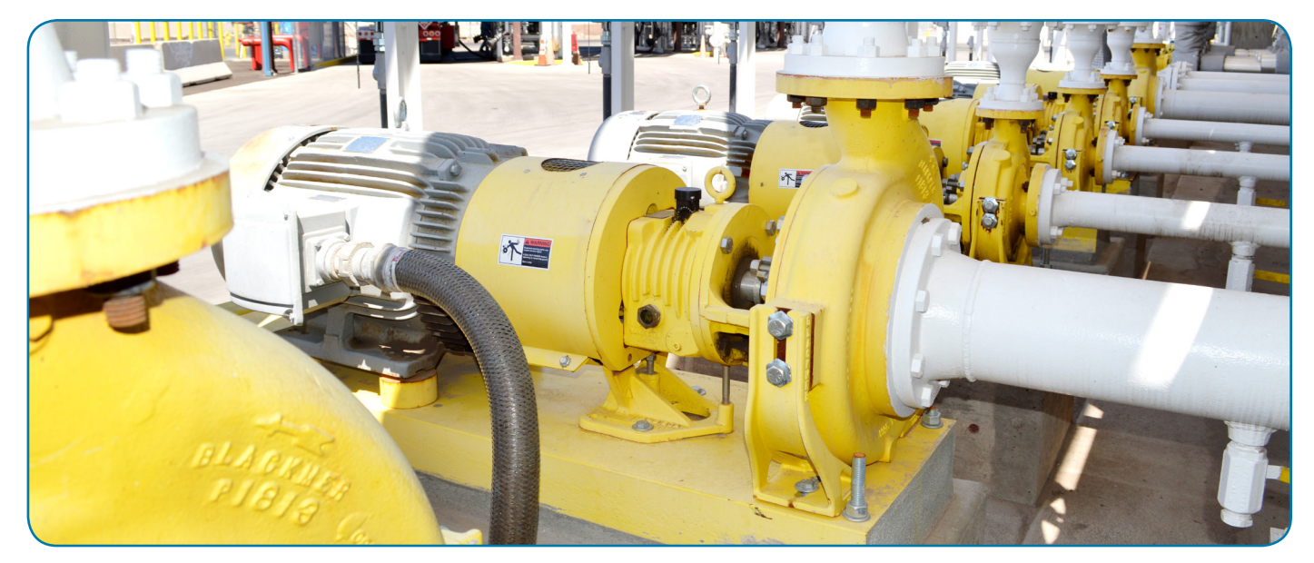
Caljet of America, LLC standardized on the Blackmer<sup>®</sup> System One<sup>®</sup> Centrifugal Pump because of its extremely reliable operation and efficient design that has decreased maintenance costs and reduced staff time in the field.