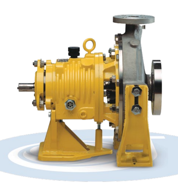
Blackmer System One model LD17 Centrifugal Pump

evaporators, it is turned into a fine mist and then blown by a series of large oscillating fans into or over a large water source, such as a lake, retention area or dam.