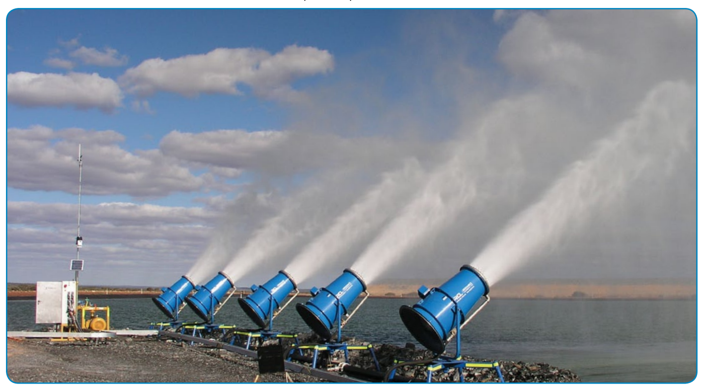
Due to new regulations, Australian mine operators can no longer discharge water into nearby waterways. Today, the most efficient and effective way to eliminate this water is through an evaporation process.

The worldwide mining industry – no matter the product, from gold to diamonds, copper to coal – is one of the most arduous to be found, with harsh, rugged, trying conditions confronted everyday. Therefore, the companies that provide equipment and services to the mining industry, specifically pumps and other rotating equipment, must be 100% confident that they are supplying their end-user customers with machines that can live up to the stresses and challenges associated with day-to-day mining operations.