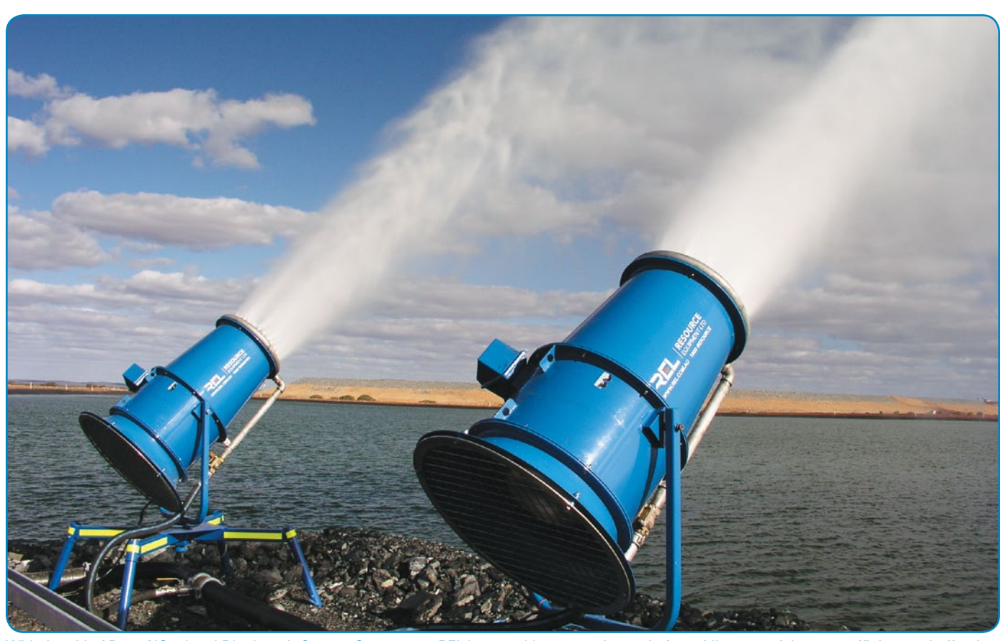
With the aid of PumpNSeal and Blackmer's System One pumps, REL is now able to meet its goal of providing one of the most efficient and effective water evaporation systems for the Australasian mining industry.