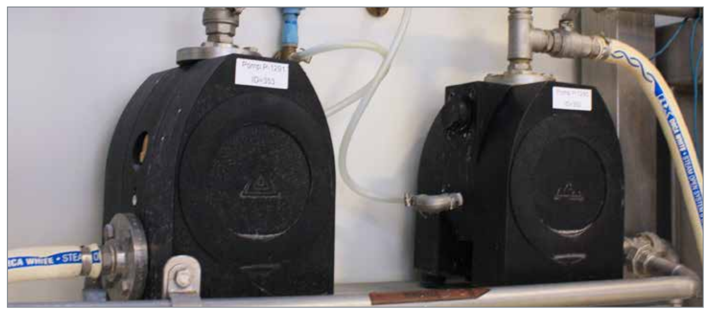
For seven years, Almatec® E-Series AODD Pumps have been providing Lab Ofichem with unparalleled safety in its API-manufacturing operations, from both a plant-personnel and end-product perspective.

these pumps we have very low downtime and that's the most important for us because if our production time is down one day we will lose at least €7,425. That's why we choose pumps based on quality, not price."